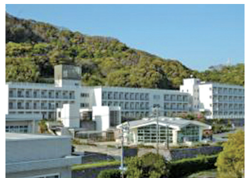
Dormitory for In-service Trainees and Canteen