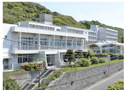
Building for In-service Training