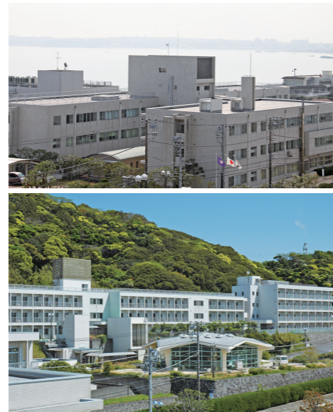
研究管理棟外観 (上), 宿泊棟及び食堂 (下) Appearance of Administration Building (above) Dormitory and Canteen (below)