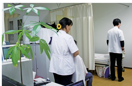
massage therapy experience