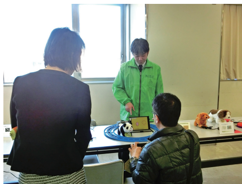
Exhibition Featuring Educational Materials and Support Devices Used in Special Needs Education

Aomori Prefectural School Education Center