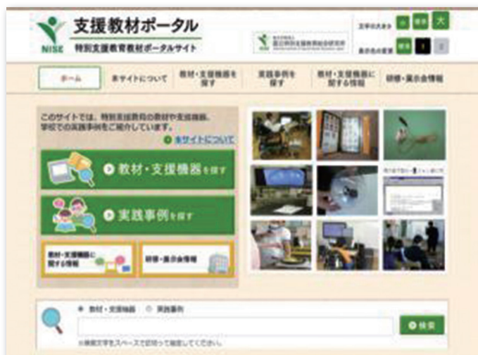
Web site on Assistive Materials Portal Site

Upon receipt of this, in March 2015, the NISE established a “Portal Site for Special Needs Education Materials” (Assistive Materials Portal Site) for the purpose of broad provision of practical application examples and related information in the context of utilization of teaching materials and assistive devices. As of April 1, 2017, the site features 745 informational items about teaching materials and assistive devices, and 87 case studies (practical examples).