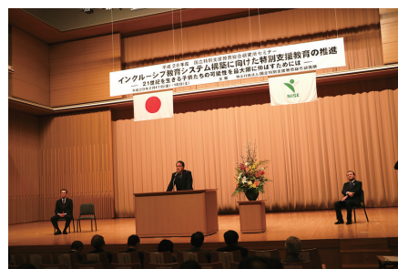
Opening ceremony of NISE seminar