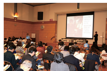
At the World Autism Awareness Day in Yokosuka