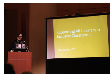
At the NISE International Symposium on Special Needs Education