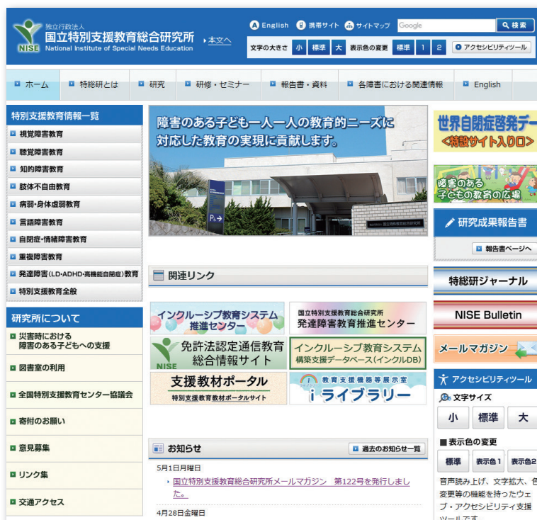
NISE website http://www.nise.go.jp/

On the NISE web browsing, “a list of information for special needs education” and “a list of information by types of users” in order to make it easier to search. In addition, the voice output function and the function to change the size and color of letters have been improved to be easier for those with disabilities to use.