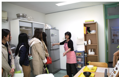
Introduction of devices for familiarity considerations and support in the daily life environment