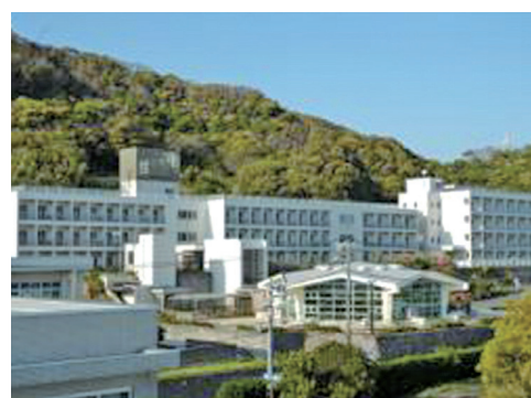
Dormitory for In-service Trainees and Canteen