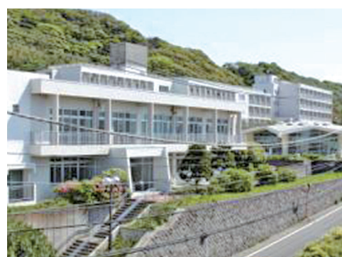
Building for In-service Training