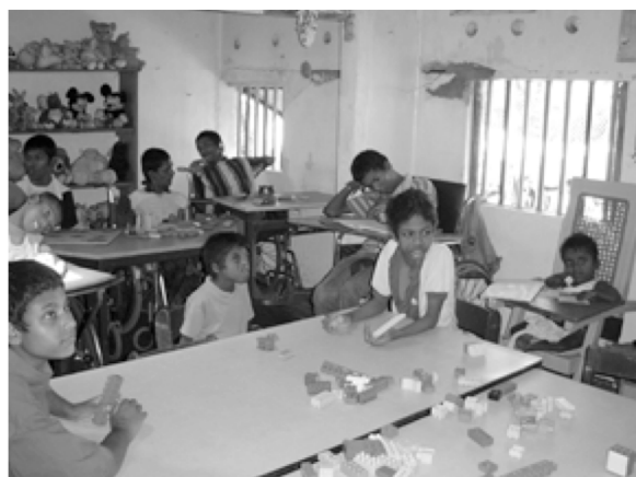
Prithipura Infant Home