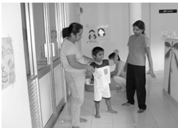
Child Guidance Centre

In present, providing services for the children with multiple disability has become one of the major responsibilities of the social welfare sector.