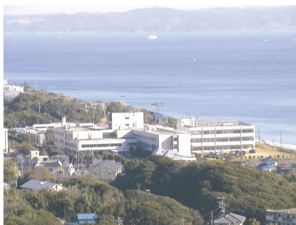
The National Institute of Special Education

Director, Division of International Exchange Program, NISE