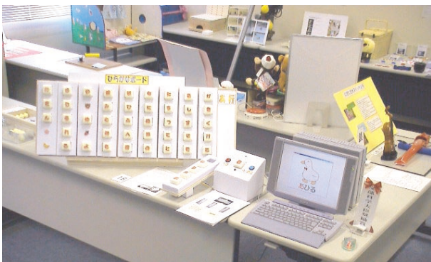
“Hiragana board” to promote to understanding Japanese letters for children with intellectual disabilities