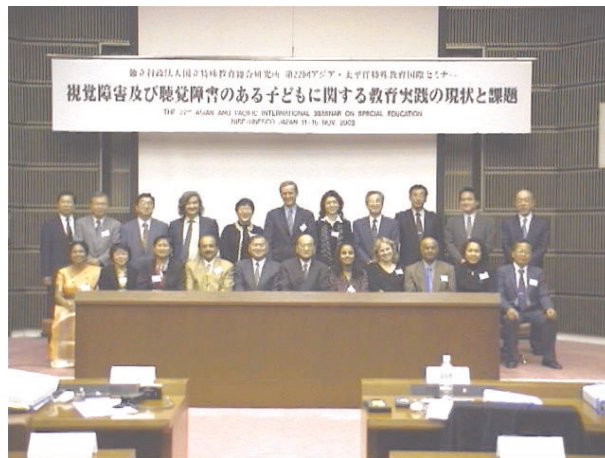
Participants from overseas and executives of NISE

Director, Department of Education for Children with Visual Impairments, NISE