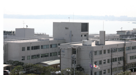
Appearance of Administration Building