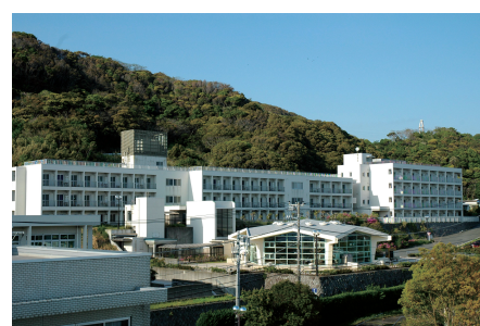
Appearance of Dormitory for In-service Trainees and Canteen (front)