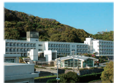
Dormitory for In-service Trainees and Canteen