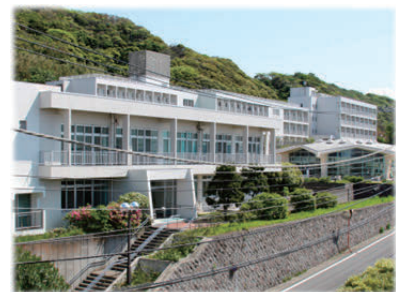
Building for In-service Training